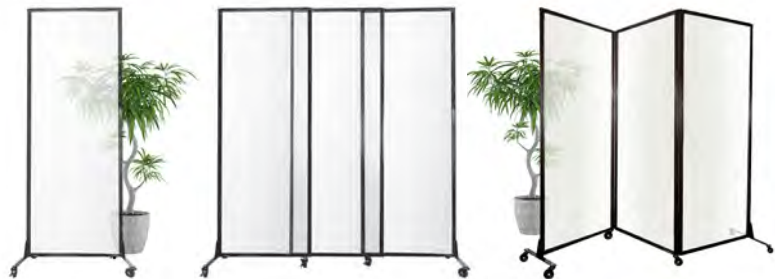
Multi-Panel Telescoping Partition