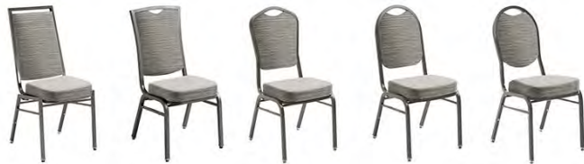
5 back style options