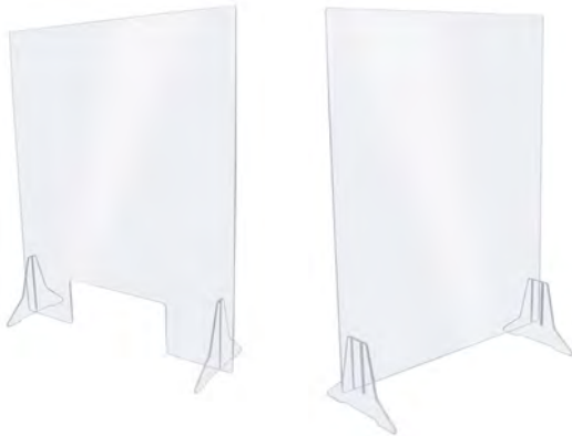
Countertop Shield w/ Cutout