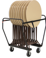
CT Cart - X Leg