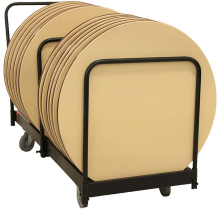
CT Cart - Small