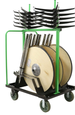
XpressPort Cocktail Cart